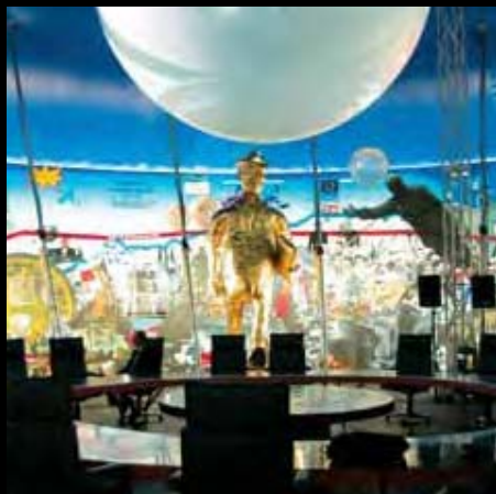
Olafur Eliasson, Your split second house , 2010 © Olafur Eliasson